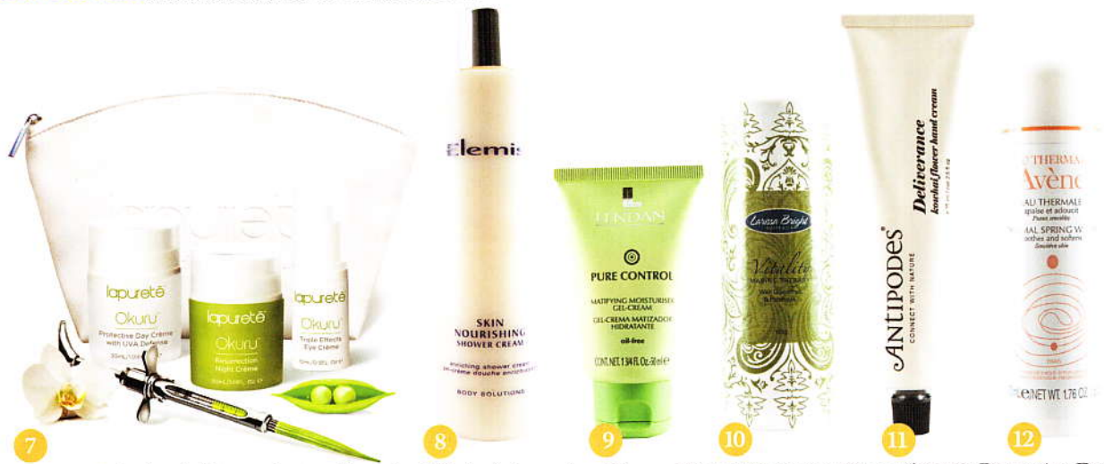
7. Lapureté Anti-wrinkle products with natural 'Botox' alternative, Okuru: Triple Effects Eye Crème, $69.90; Protective Day Crème with UVA Defense, $59.90; and Resurrection Night Crème, $59.90 8. Elemis Skin Nourishing Shower Cream, $79 9. Lendan Pure Control Matifying Moisturizer Gel-Cream, $75 10. Larissa Bright Vitality Bath Soak, $16.95 11. Antipodes Deliverance Kowhai Flower Hand Cream, $32 12. Avene Thermal Spring Water, 50ml, $11.95