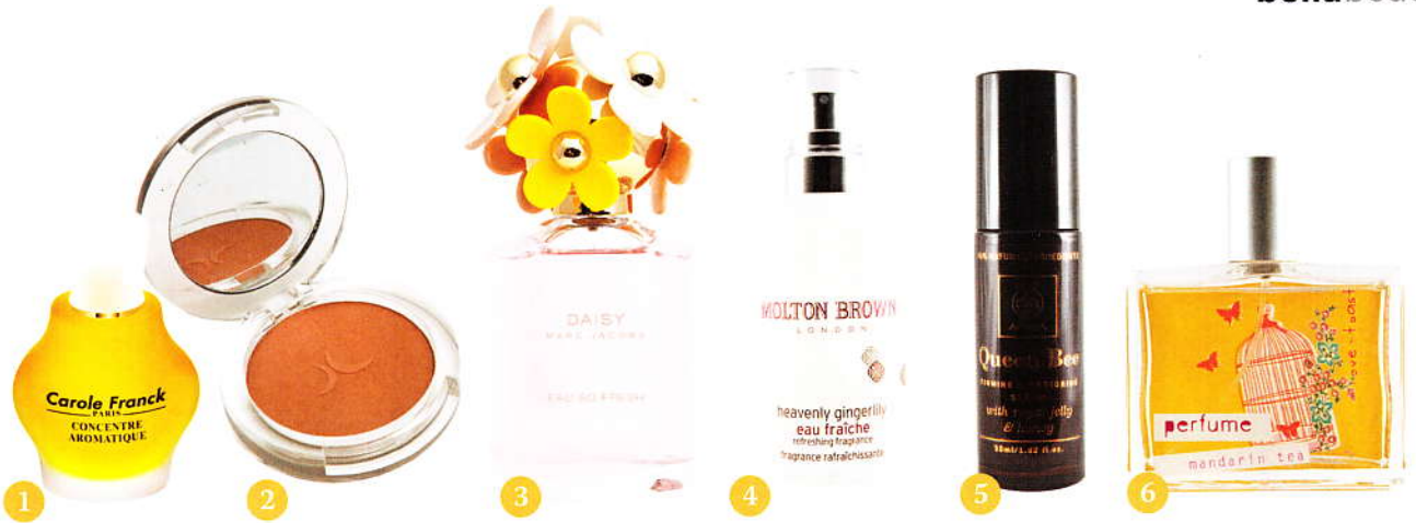
1. Carole Franck Aromatic Concentrate Essential Oil, 15ml, $79 2. Ultraceuticals Ultra Active Mineral Colour Even Skintone Compact bronzer in Terracotta, $55 3. Marc Jacobs Daisy Eau So Fresh EDT, 75mL, $115 4. Molton Brown Heavenly Gingerlily eau fraiche, 100mL, $55 5. Apivita Queen Bee Firming & Restoring Serum with Royal Jelly and Honey, $114.90 6. Love & Toast Mandarin Tea Eau de Perfume, $59.95