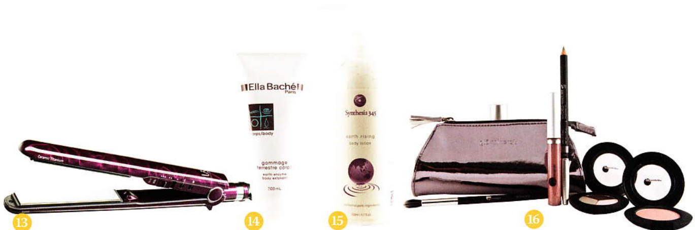
13. Vidal Sassoon VS Premier Collection Gen Ultimate Straightener with titanium plates, $172.95 14. Ella Bache Earth Enzyme Body Exfoliant, $45 15. Synthesis 345 Organics Earth Rising 'Miracle' Lotion, 140mL, $59.50 16 Glo Minerals Allure Kit, $99, with Gloss in whisper, Eye Shadow Trio in Napoli, Blush in Bellini, Precision Eye Pencil in Silver Lilac and Texture Eye Brush in a go-anywhere metallic lilac bag.