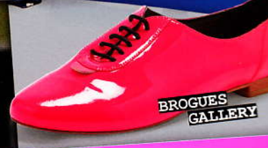
IN OUR CLUTCH